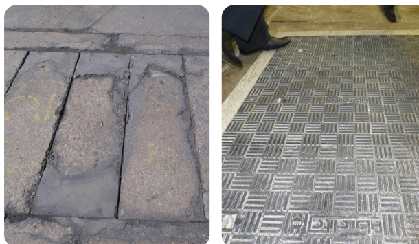
No trips, slips or falls. Fibrelite's GRP composite covers alongside the old concrete trench panels

With many lengths, widths and depths of trench covers available together with the option of adding colour and logos, Fibrelite's trench covers offer an extremely versatile solution. All covers are BS EN 124 load rated, from A15 (1.5 tonne, pedestrian traffic) to E600 (60 tonne). Suitable for many applications ranging from stadiums, water sewerage treatment plants, retail, industrial and commercial developments to airports, ports and dockyards.