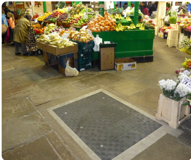
One of the 8 trench panel installations in the busy city-centre market