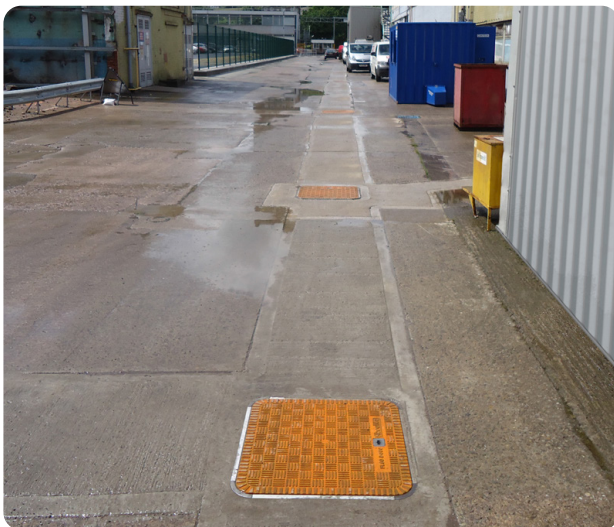
Heavy duty Fibrelite FL60/D400's

Fibrelite has been specified to provide watertight GRP composite access covers for over 120 remediation wells linked in hundreds of metres of trenches. Covers were either C250 (25 tonne) for standard traffic and D400 (40 tonne) for HGV loading areas.