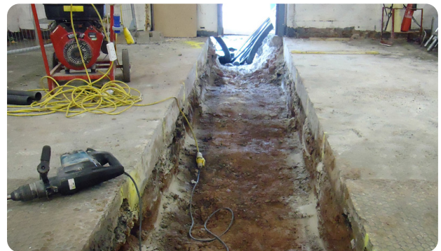
The trenches before Fibrelite install