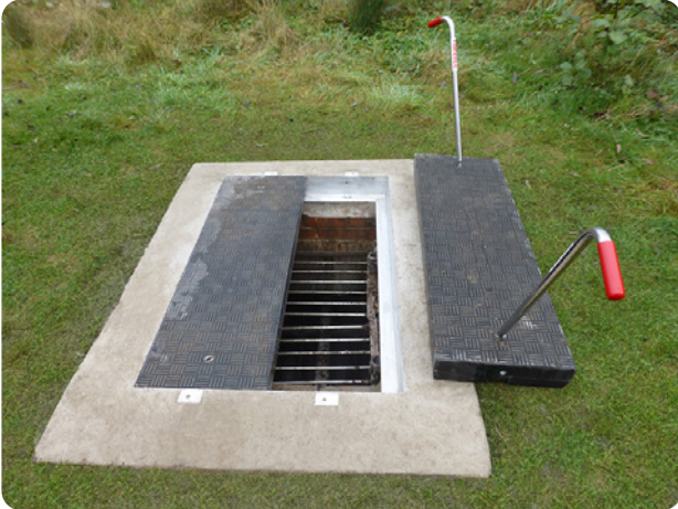
Maintenance free and no mechanical parts: Fibrelite's FM45 Composite Trench Panels