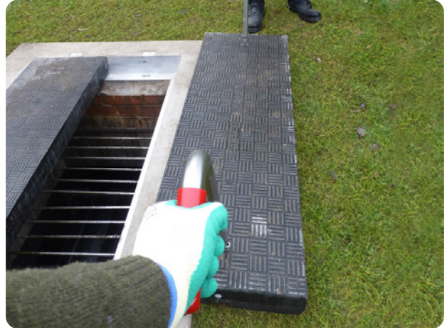
Fibrelite's specially designed lifting handle