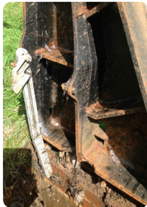
Some of the Fall-restraints, gas assists and mechanical spring struts have been failing creating serious risk of injury to technicians