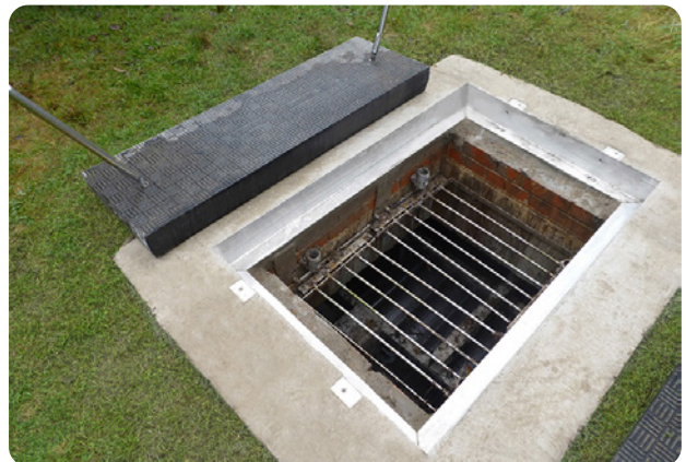
Safe and easy manual removal: Fibrelite FM45 covers are removed by hand from the CSOS (Combined Sewerage Overflow System) chamber

With no need for hinges or mechanical parts there is no potential for failure and no requirement for ongoing maintenance- the Fibrelite FM45 is a 'fit and forget' product. What's more, with weight lifted not going beyond 25kg, Fibrelite's trench panels tick all the boxes in terms of Health and Safety. Mark Corbett Safety Coach for West Waste Water said: Using these covers eliminates manual handling issues and injury; the keys are at waist height so there's no need to bend down and the covers don't seize up so we don't need to bend down with extra tools to release them. And because they're so light, lifting is quicker which means we get more work done.