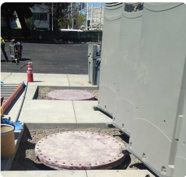
Fire Manway lids (tank buried underneath)

An exclusive aluminum frame was used to install Fibrelite H20 trench lids. An H20 load rating was necessary since the panels are located on a sidewalk where heavy traffic regularly occurs. The frame was set higher than the sidewalk to create a slight slope in case of traffic exposure. Once the slope was created, the concrete-dried panels were installed and the maintenance department accessed the tank to check water levels and fill and disperse water as needed.