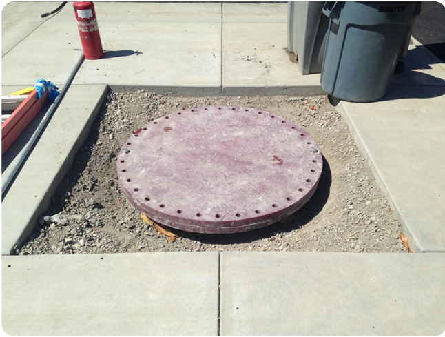
Fire protection tanks

A California business development required easy and quick access to their fire water manway tanks in case of emergency. They chose Fibrelite's H20 rated trench lids which can be manually lifted so heavy machinery is not required. Fire protection tanks are water storage tanks specifically designed and used for commercial, industrial, residential, and institutional building's fire protection systems.