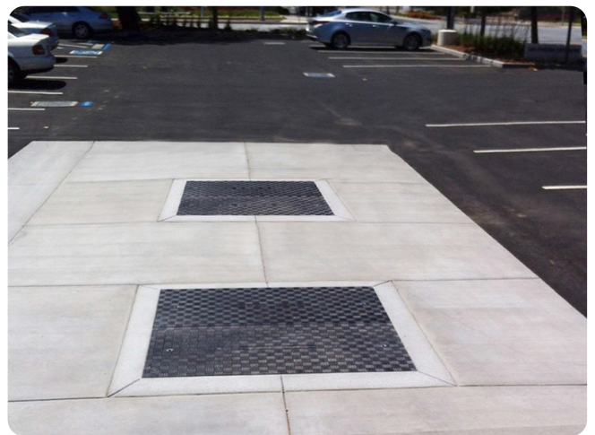
Lightweight composite trench covers

For more information on Fibrelite's product range please contact us: