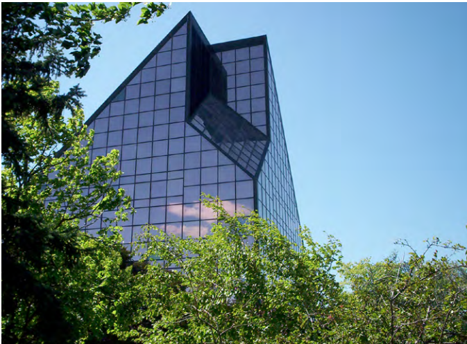
Fibrelite covers enable safe easy access to under floor utilities at the Royal Canadian Mint

Made-to-Fit Fibrelite Covers Provide Safe Simple Access Solution for the Royal Canadian Mint