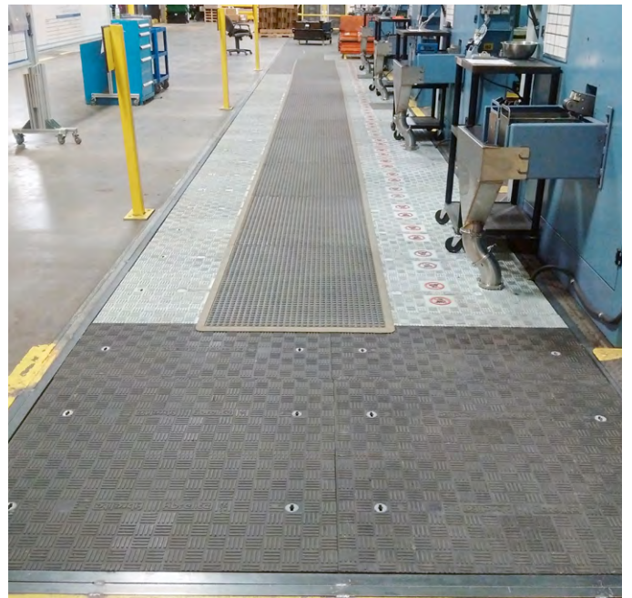
Lightweight Fibrelite FRP trench covers allow easy safe manual removal

For forklift areas (Light Duty - 28,000lbs/B125) black FRP covers were manufactured, while for non-forklift areas (Medium Light Duty - 11,200lbs) FRP covers were produced in a custom light gray with a raised no-forklift graphic on top.