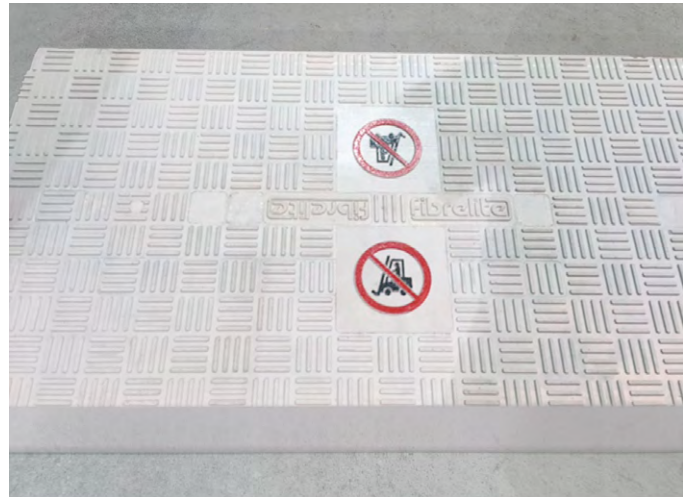
Custom FRP composite trench covers manufactured to fit into existing rebate