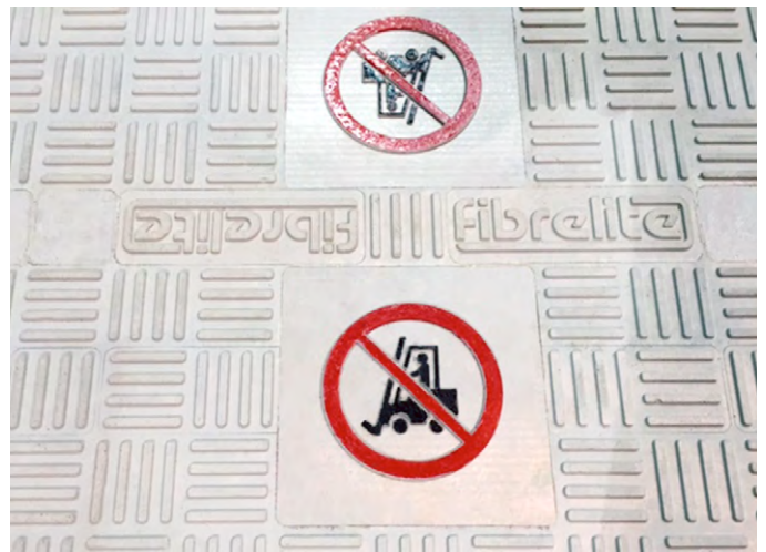
Custom no-forklift graphic and cover colour for non-forklift areas